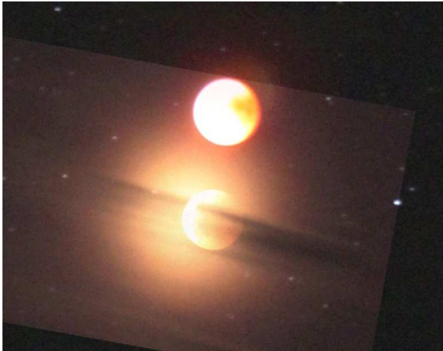
Figure 5. Parallax of the Moon between Pretoria and Riesa at 23.00 SAST. The image is a combination of two images, one taken by L. Glagowski and the other one by B. Cunow.