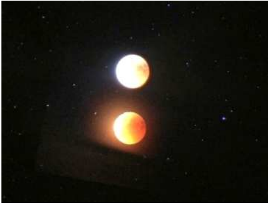
Figure 2. Parallax of the Moon between Pretoria and Riesa at 23.00 SAST. The image is a combination of two images, one taken by M. Nitzsche and the other one by P. Kühn.