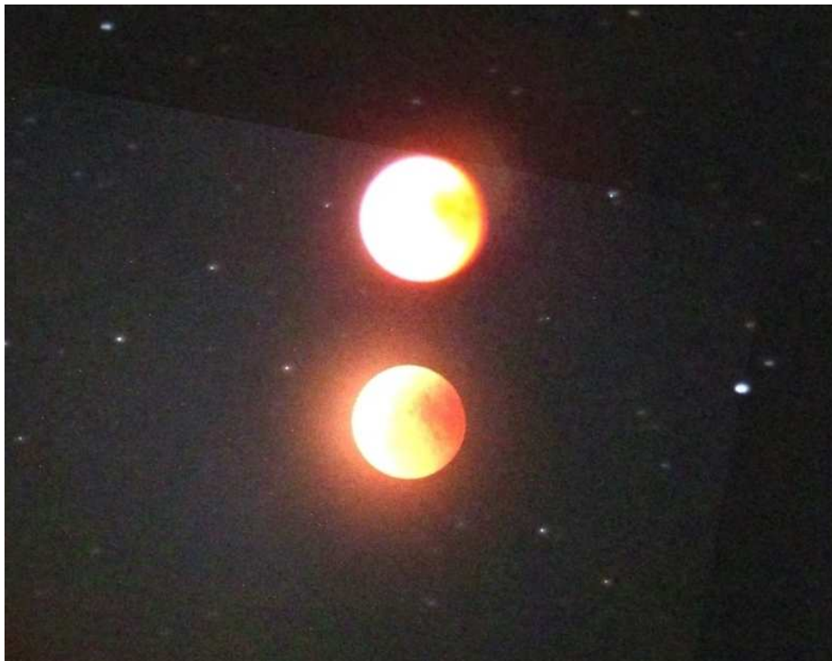
Figure 1. Parallax of the Moon between Pretoria and Riesa at 23.00 SAST. The image is a combination of two images, one taken by S. Schwager and the other one by B. Cunow.

Figures 1-5 show the lunar parallax between Riesa and Pretoria at 23.00 SAST. Each picture is a combination of an image taken in Pretoria and one obtained in Riesa. It shows the eclipsed Moon with the starry background. North is up and east is to the left in all images. The northern Moon is the one seen from South Africa, the southern Moon is the one observed from Germany. The parallax of the Moon is clearly visible - the two Moons are 1.7 Moon diameters apart.