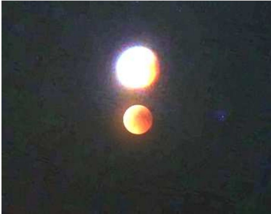
Figure 4. Parallax of the Moon between Pretoria and Riesa at 23.00 SAST. The image is a combination of two images, one taken by C. Bartzsch and the other one by N. Young.