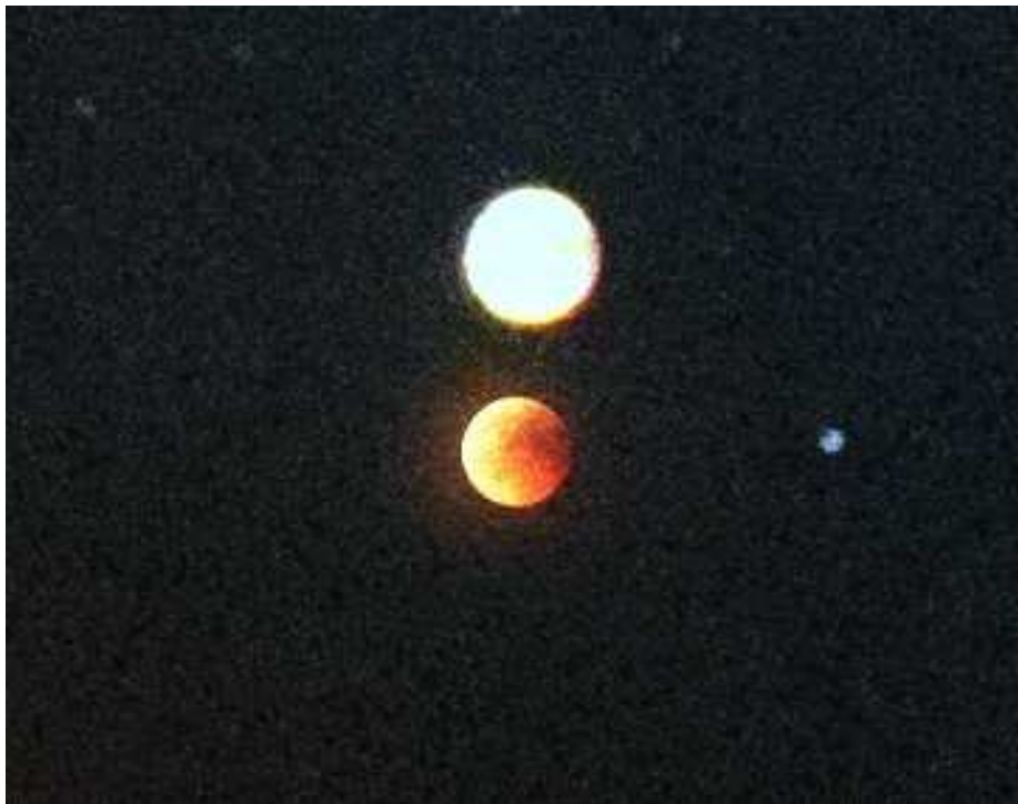
Figure 3. Parallax of the Moon between Pretoria and Riesa at 23.00 SAST. The image is a combination of two images, one taken by C. Bartsch and the other one by P. Jacobs.